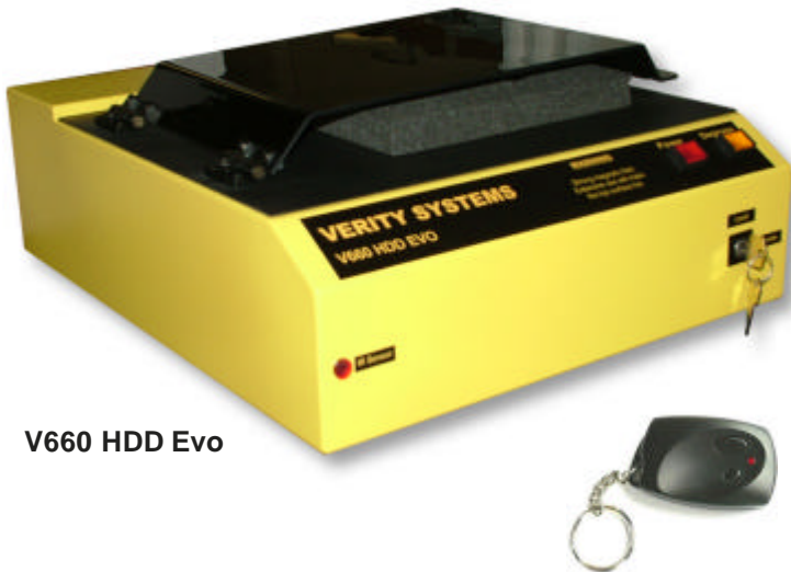
V660 HDD Evo

The V660 HDD Evo is a high energy, degausser especially designed to eliminate all data from computer, laptop and server hard drives. The V660 will also erase data from high coercivity tape, including LTO, DLT, Super DLT, AIT and more.