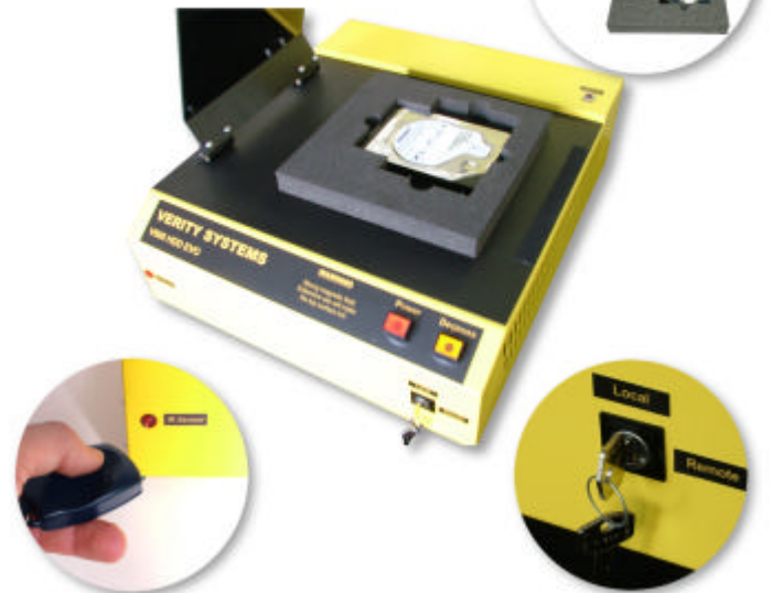
Infrared Remote Control For safe, hands-free erasure