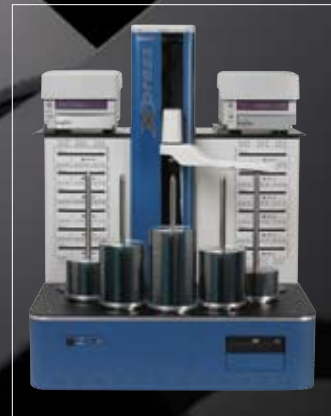
High Capacity Mixed Media CD/DVD Production Microtech's Xpress XL